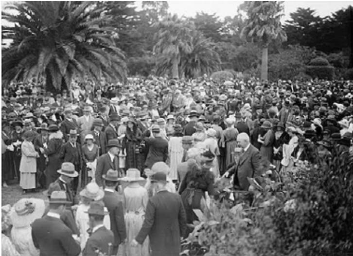
Williamstown Botanic Gardens 13 December 1922.

A small team of Friends has been working during ISO on correcting newspaper articles on the Williamstown Botanic Gardens in Trove, the on-line database hosted by the National Library of Australia. It is hoped that the corrected articles will help in future garden research.