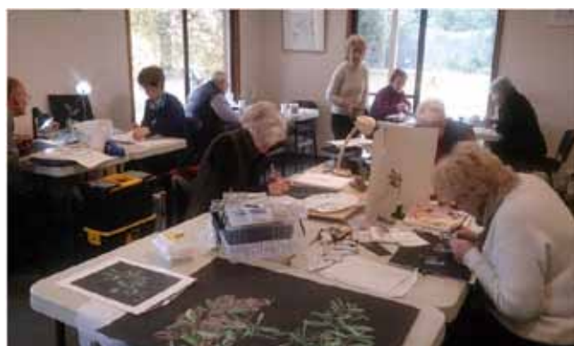
Gardening in the Gardens and the Illustrators’ workshop.