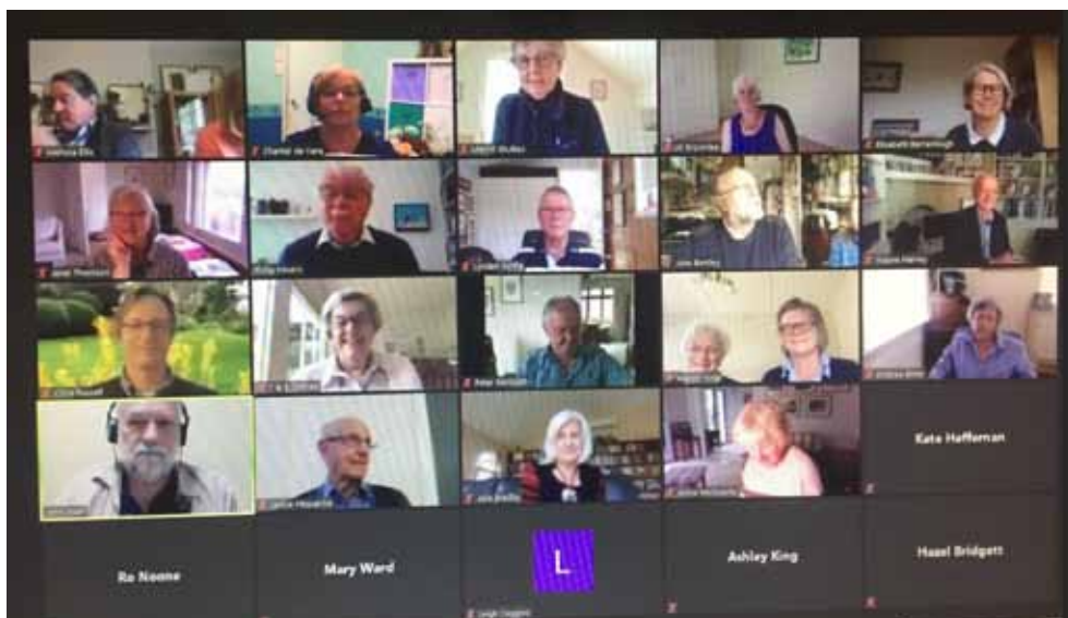
Some of the ZOOM AGM

We are all looking forward to having a face to face AGM next year in Adelaide. Let's keep our collective fingers crossed.