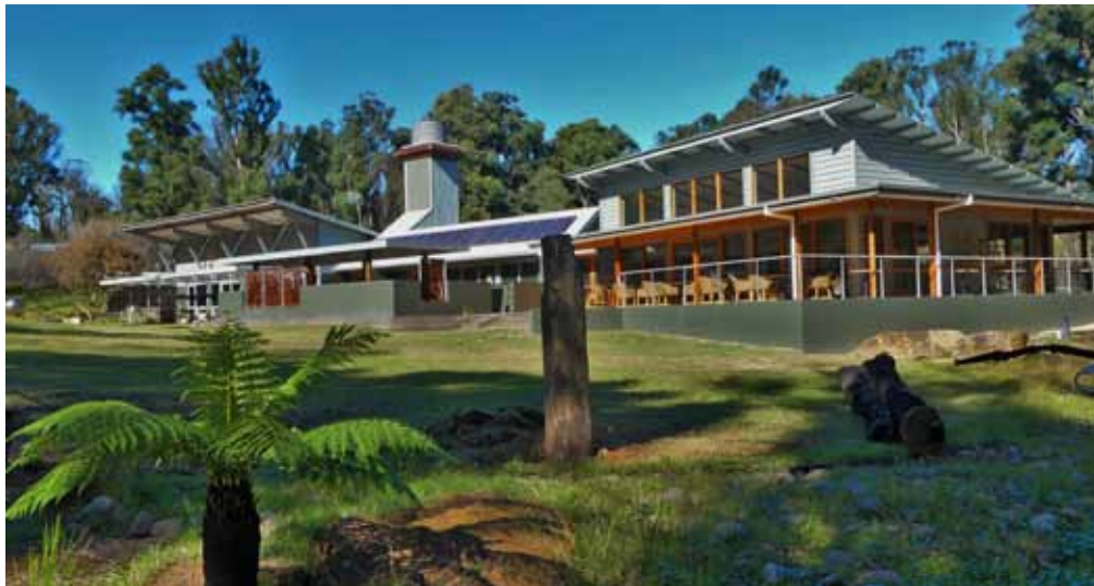
Eurobodalla Visitor Centre in July 2020.

Eurobodalla Regional Botanic Garden is returning to life after the Black Summer fire that destroyed most of the Garden. This recovery is only thanks to the heroic efforts of staff, Friends, volunteers and the whole community who have worked to rebuild and regrow what was burnt. And Nature has done her own amazing thing as well.