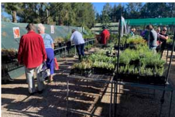
Customers doing a good job of social distancing at the plant sale

A difficult year for all Friends groups. We didn't submit anything from Orange because we haven't done anything due to the pandemic. Our last contribution was mainly about cancelling our Autumn sale due to the pandemic. We are doing our November plant sale at the moment by spreading it over two weekends and have found it works well to have people booked in so we can ensure there isn't a bun rush at the beginning and people are separated in time and space to ensure social distancing. When they book, they know they will have an hour to browse and so it is much more relaxed for both customers and Friends staffing the sale. We still made as much